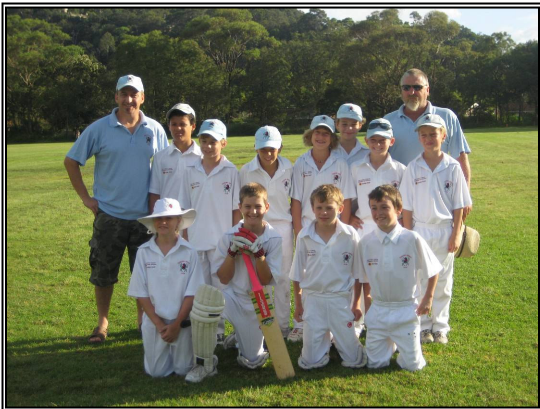
Under 11A's Blue – Semi-Finalists 2008-2009