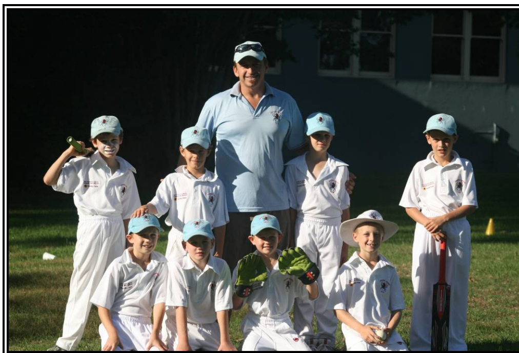
Under 9's Blue