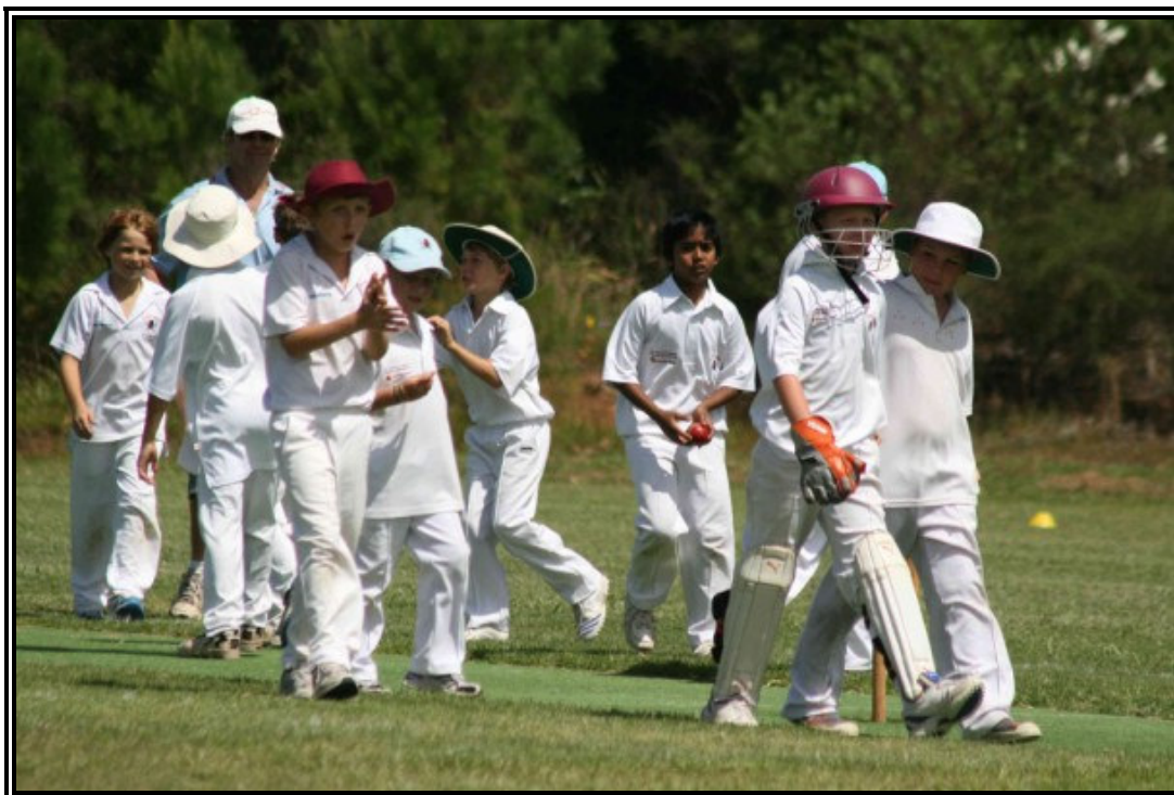
The Under 11A's Red