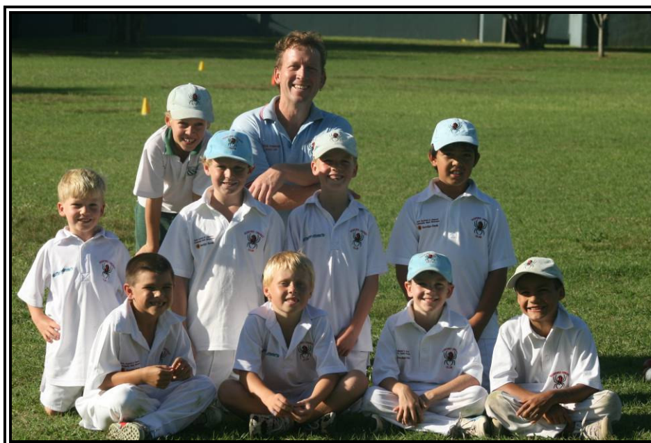
The Still Undefeated Under 9's Red